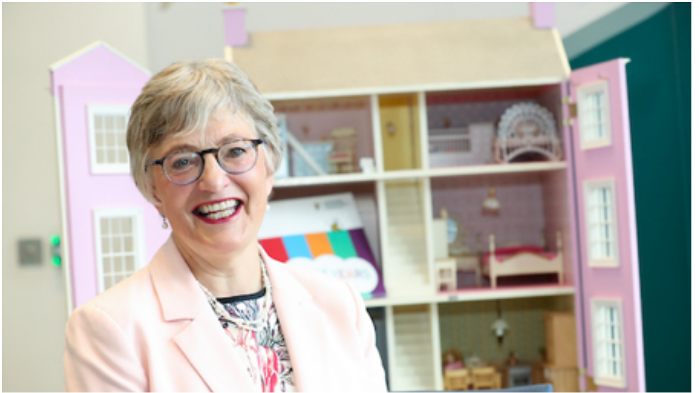
Minister Katherine Zappone at the launch of the Draft Childminding Action Plan in DCYA